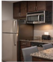
HOUSEKEEPING & SUPERVISOR

At Residence Inn Orangeburg Rockland/Bergen New York, we pride ourselves in caring about the little things that make a big difference — from our warm welcome to serving the communities around us. You can make real connections, create a workplace that matters and make memories to last a lifetime. From check-in to check-out, we deliver award winning service ... and always with a smile.