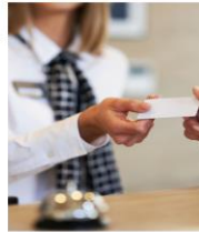
FRONT DESK & HOUSEPERSON